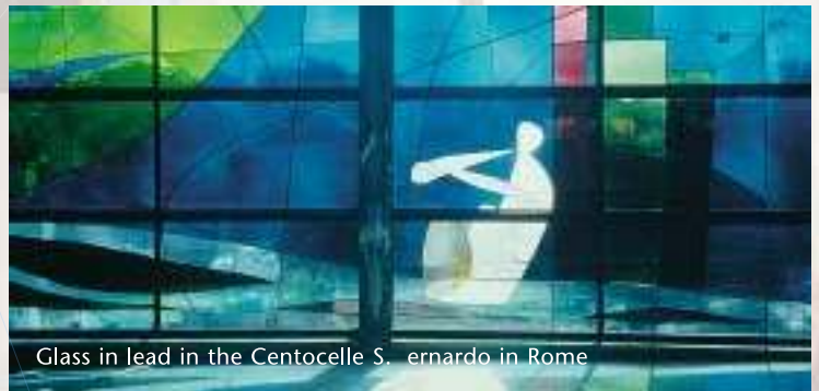
Glass in lead in the Centocelle S. ernardo in Rome

These machine-made glass pressings with fire polished surface can be fused with ARTISTA® without any problem. The special optical effect of ARTISTA® Drop is that they magnify anything underneath them. When they are fused, they produce some very interesting effects as the colour merge and fusing various drops together results in remarkable honeycomb structures.